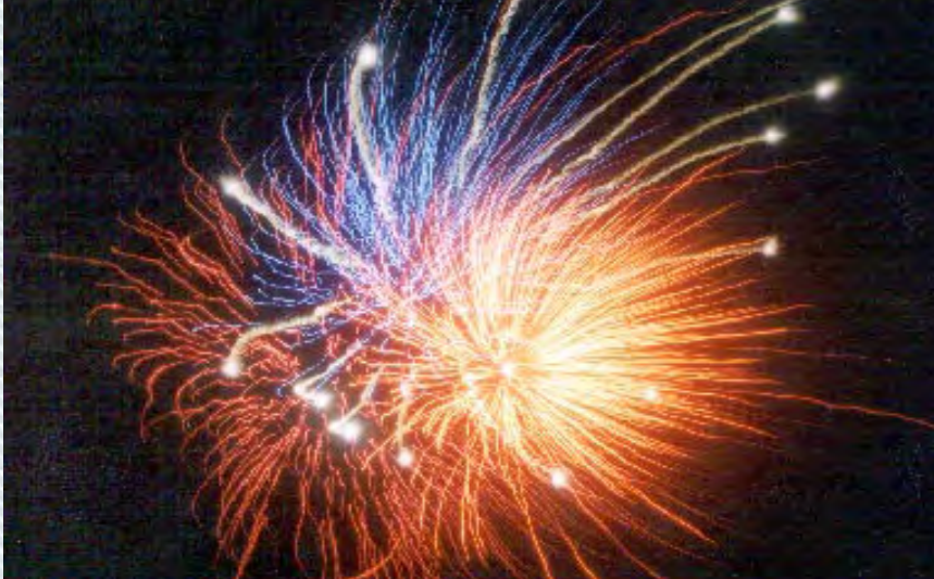
A firework display in Yukon during their annual Freedom Fest.