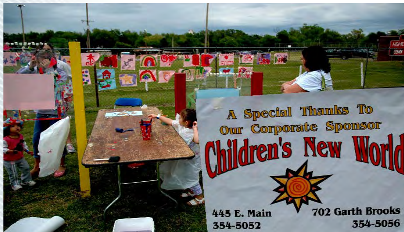
Children's New World was the Corporate Sponsor of the Festival of the Child. Over 2,500 people attended the festival which featured over 25 fun-filled events.