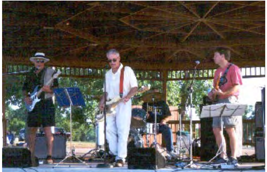
The Hudson Bay Company in Concert at the Chisholm Trail Park Gazebo.

There will also be food and soft drinks available to purchase. You are invited to bring a lawnchair or blanket, bring your family and just enjoy the music ! ●